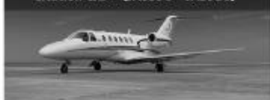
Citation CJ2+ (JA359C • JA391C)