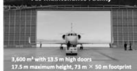
FBJ Maintenance Facility

3,600 m 2 with 13.5 m high doors 17.5 m maximum height, 73 m × 50 m footprint